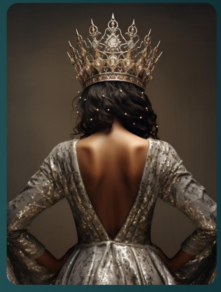
An Exclusive Float Appearance at Hollywood Carnival 2024